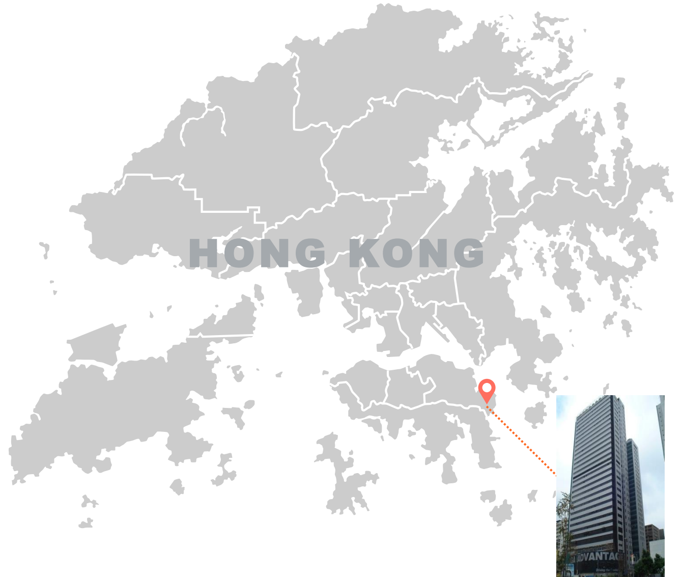
Mega-I Data Center