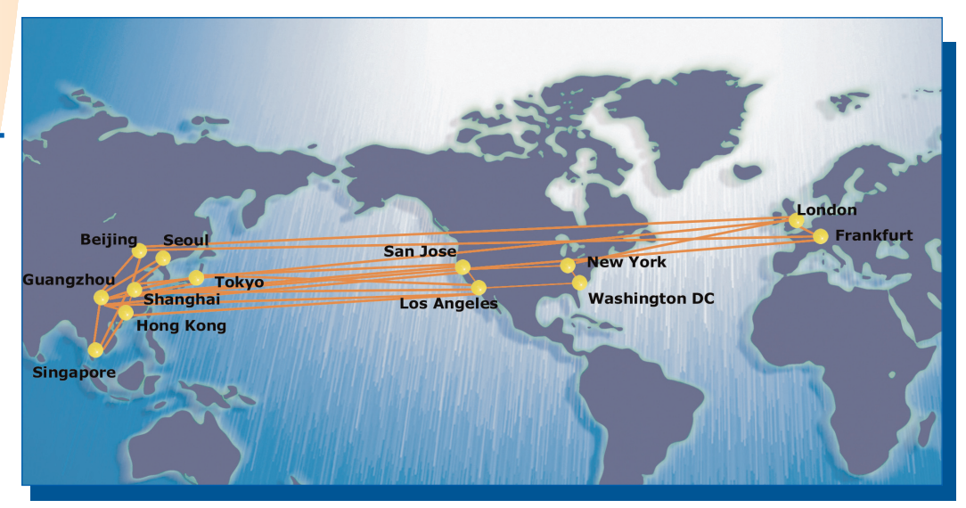
Figure 3: China Telecom Next Generation Carrying Network (CN2) Map

Extending services into a new geographic region presents risks to any carrier. Management may mitigate some of that risk by selecting to do business with a strong, forward-looking global leader that is dedicated to its clients and carrier partners.